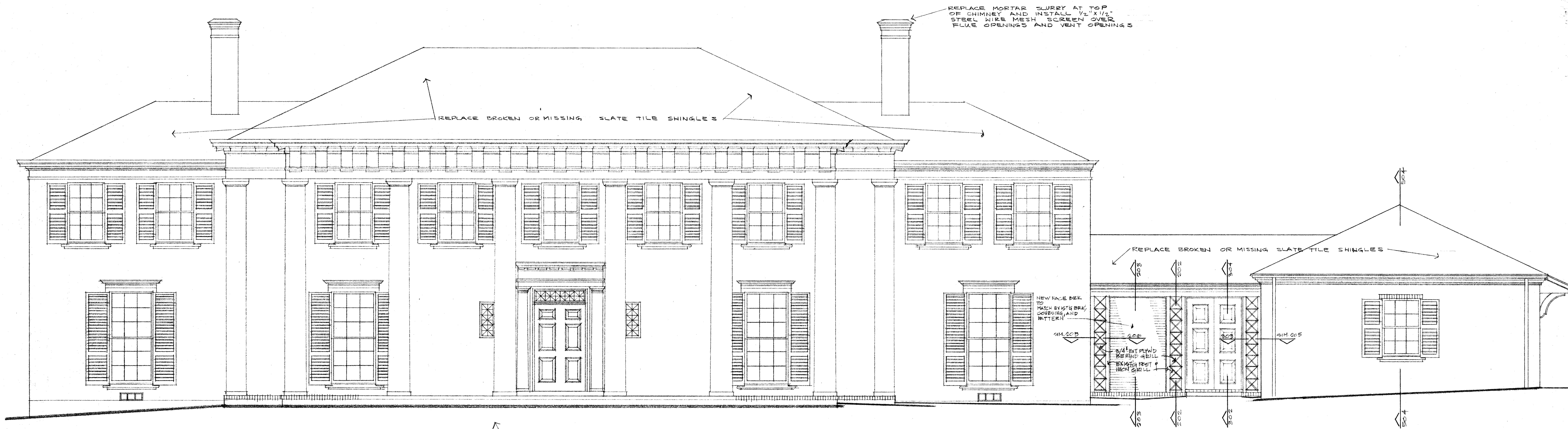
403 North Elevation