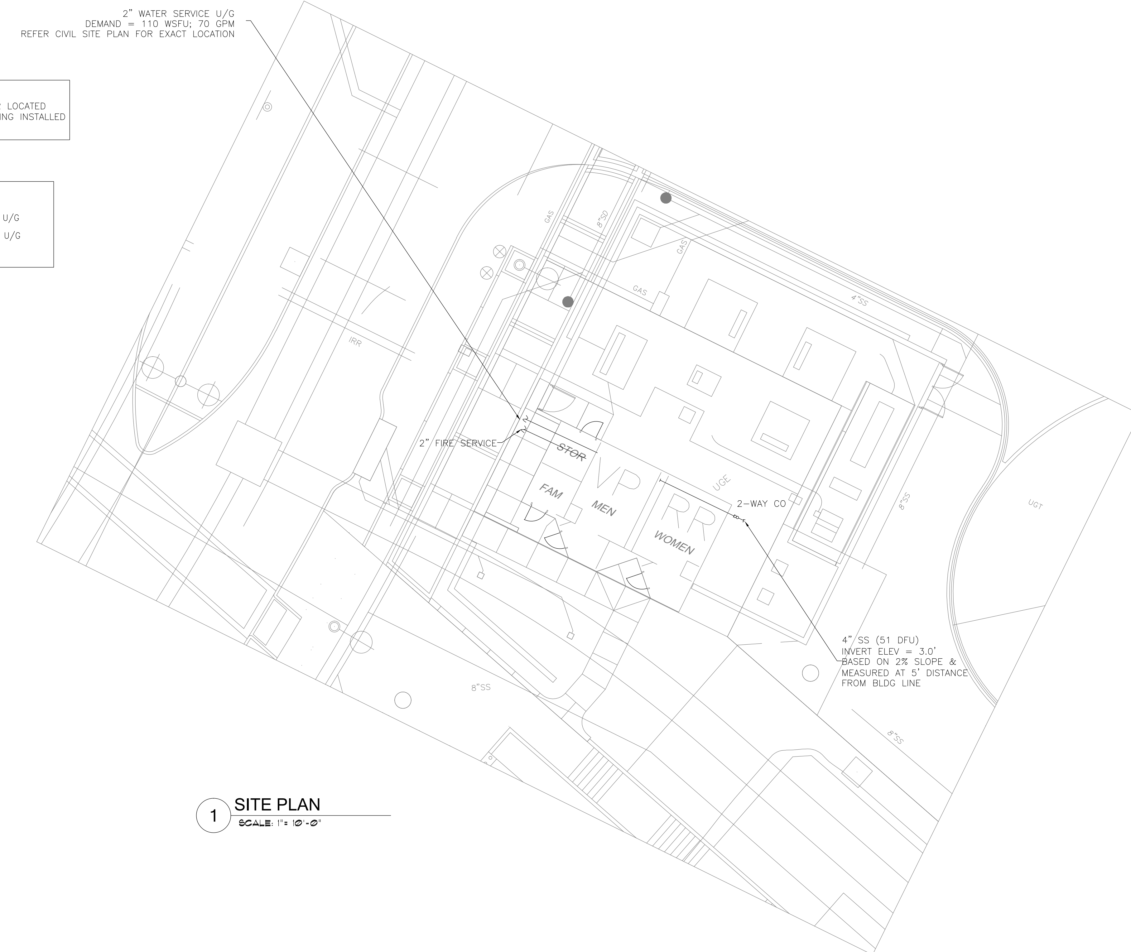
1 SITE PLAN SCALE: 1" = 10'-0"