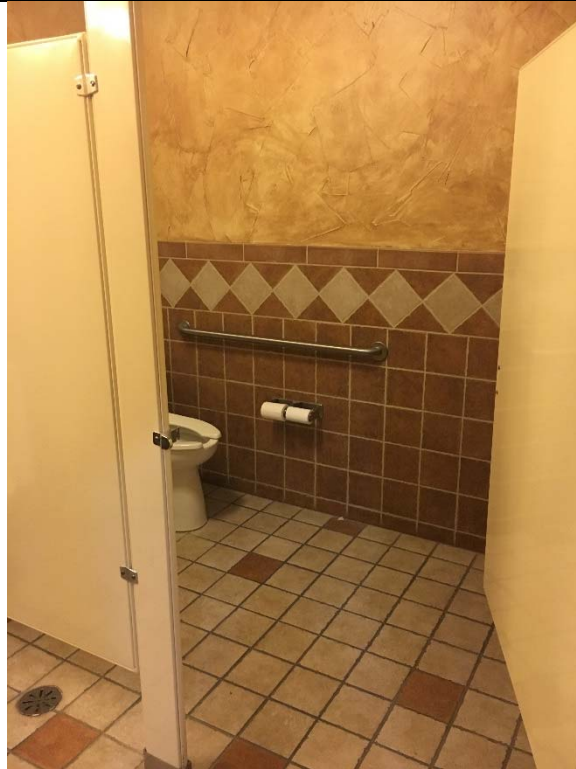
Violation 9 - Men's Restroom: Stall door is not self-closing and does not have door hardware.