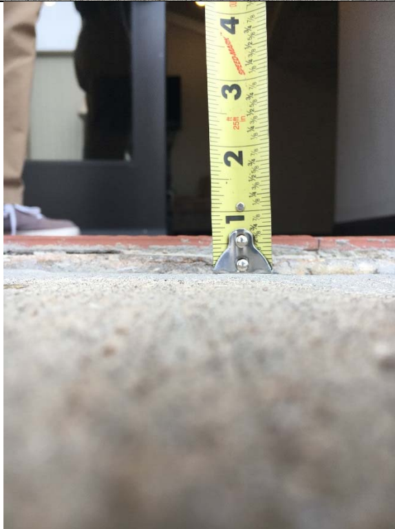
Violation 5 - The main entrance has a broken concrete resulting in a change in level greater than 1/4".