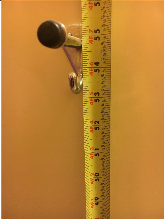
Violation 11 - Men's Restroom: The coat hook is mounted at 55" above finished floor to the highest operable part.