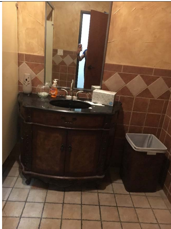
Violation 12 - Women's Restroom: Lavatory does not have the required toe and knee clearance.