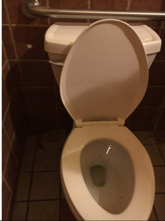
Violation 13 - Women's Restroom: The flush control is on the closed side of the water closet.