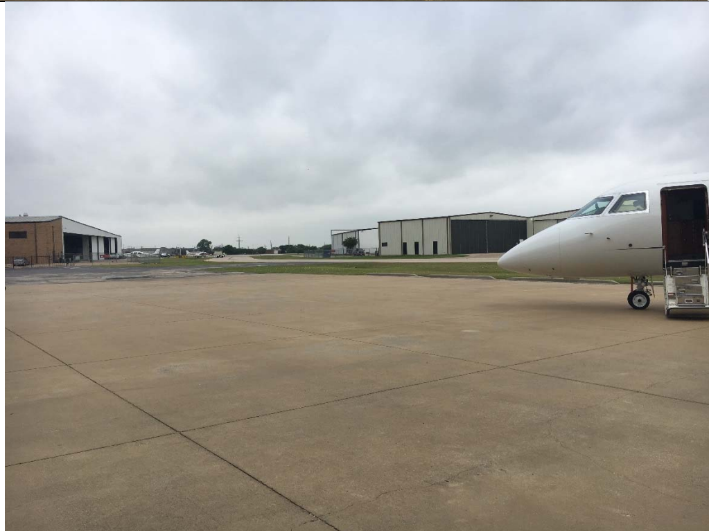
Violation 2 - There are no accessible parking spaces provided in the back hangar parking area.