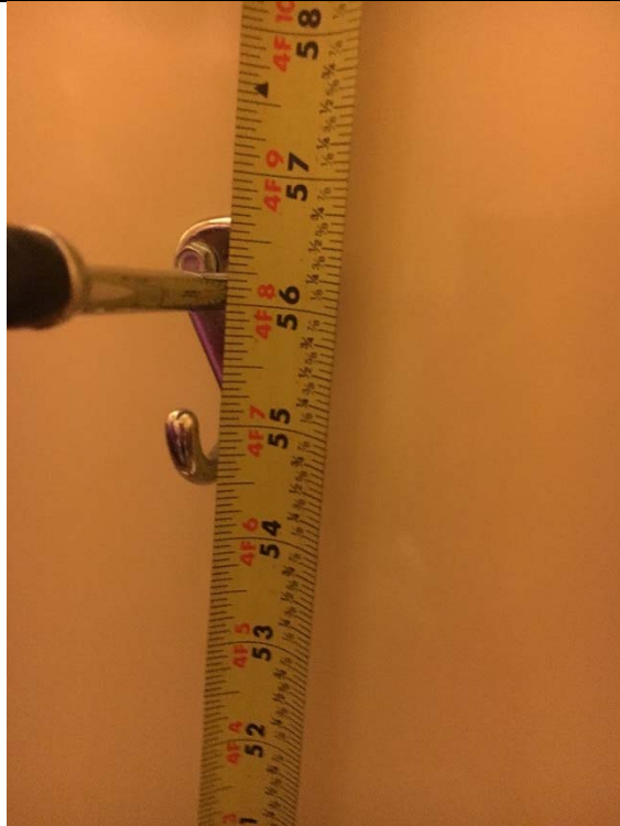
Violation 15 - Women's Restroom: The coat hook is mounted at 56" above finished floor to the highest operable part.