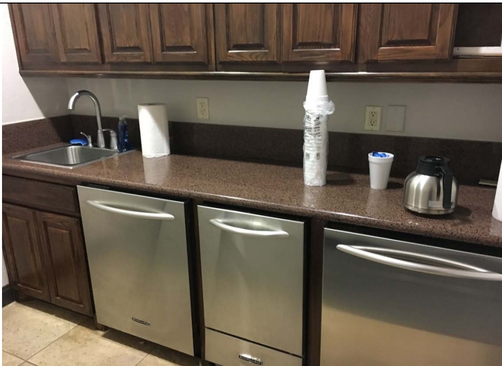
Violation 16 - The small breakroom near the front of the facility sink is 36" high where 34" maximum is required.