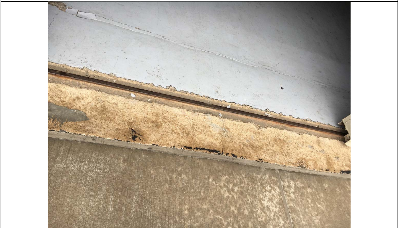
Violation 4 - The route into the hangar has a change in level greater than 1/4".