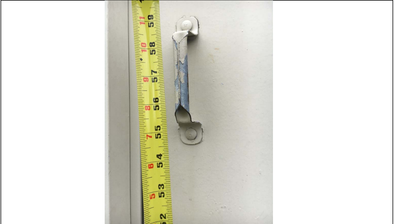
Violation 3 - The entrance door handle is mounted at 56" above finished floor.