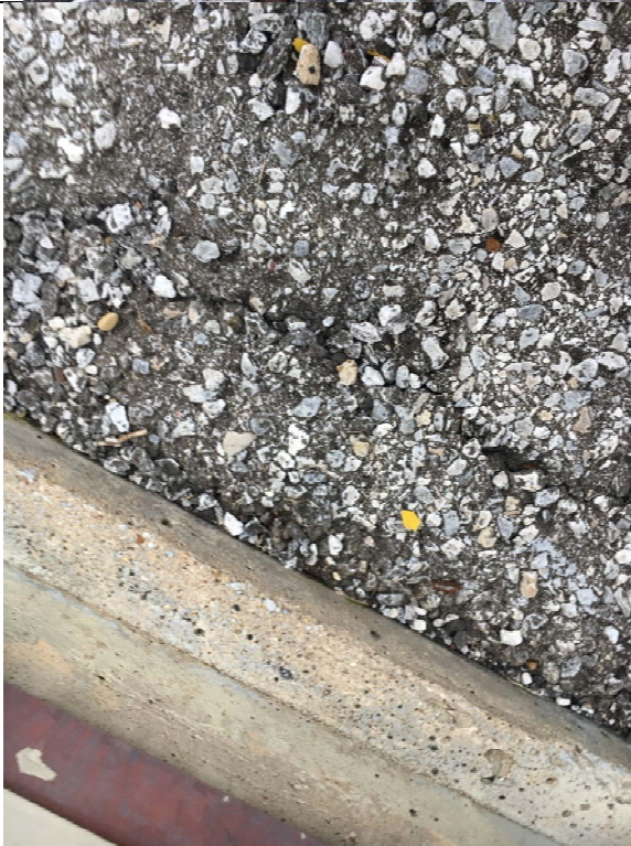
Violation 2 - Entrance door has a 1-1/2" step up then another 4-5/16" step to enter the building.