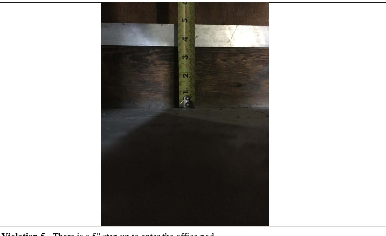
Violation 5 - There is a 5" step up to enter the office pod.