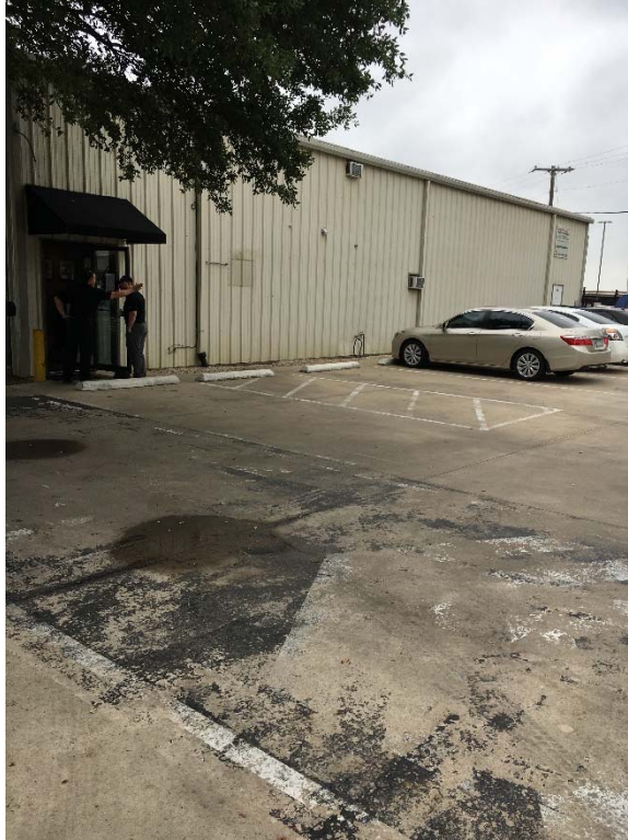
Violation 1 - There is accessible parking provided, however, no signage is provided.