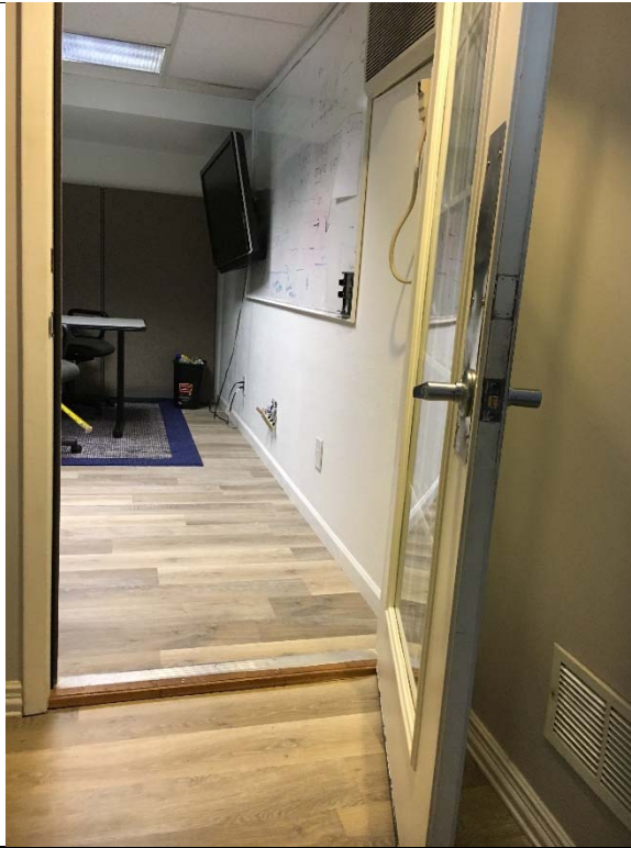
Violation 7 - There is a 1-1/8" threshold at the door leading into the lounge area on the 2nd floor.