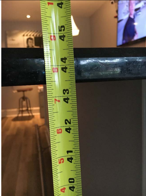
Violation 4 - The reception desk 44.5" to the top of the counter.