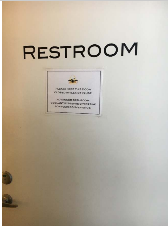
Violation 8 - Restroom signage is on the door and does not have Braille or tactile characters.