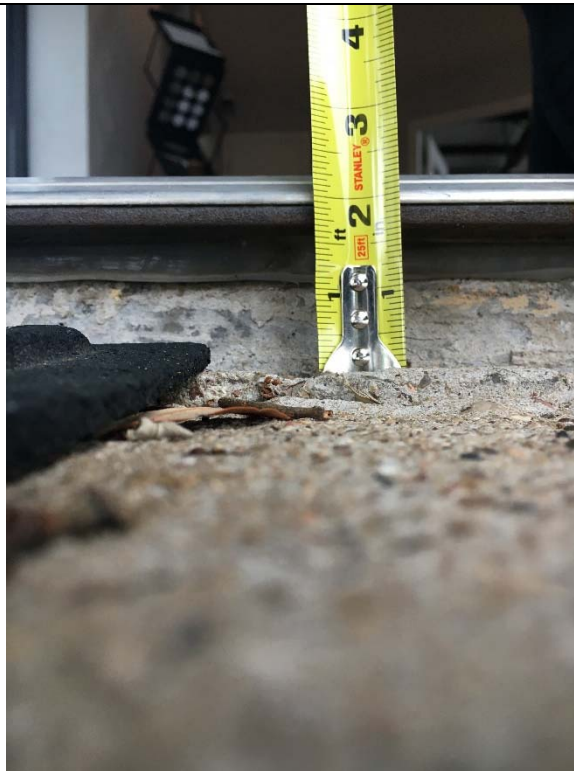
Violation 2 - There is a 2-3/16" step up at the entry door.