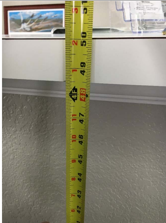
Violation 9 - The reception desk is mounted at 50" above finished floor to the top of the counter.