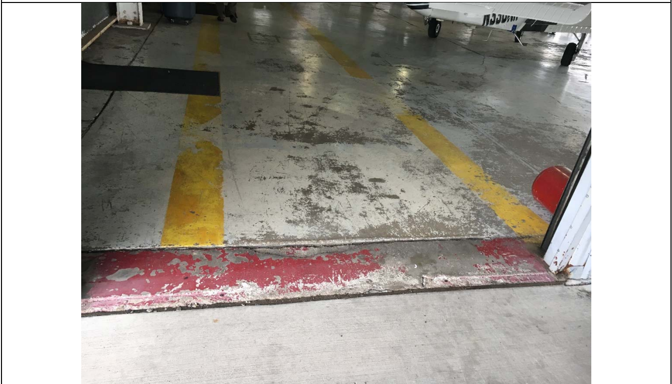
Violation 6 - The entrance into the airplane hangar area from outside has broken, uneven pavement.