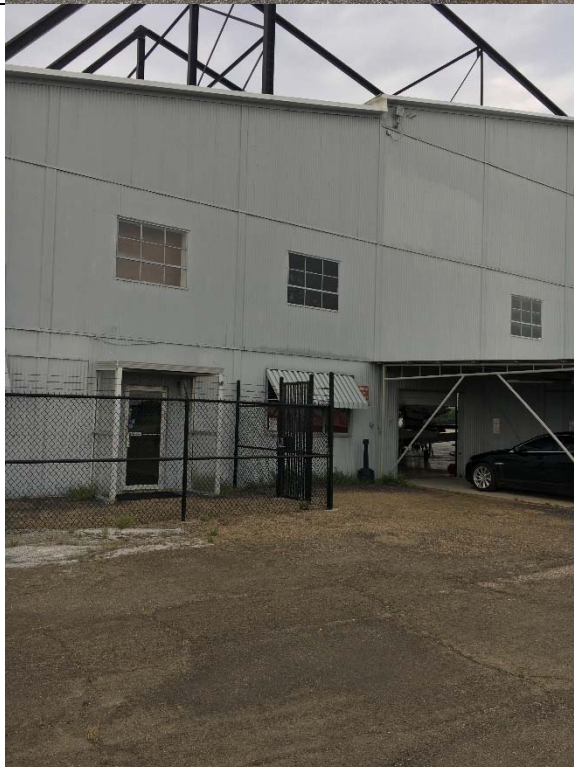
Violation 2 - The ground surface in the parking area is broken, uneven and unstable.