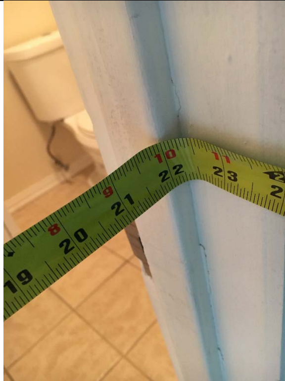
Violation 12 - The door to the restroom is only 22" wide where a minimum of 32" is required.