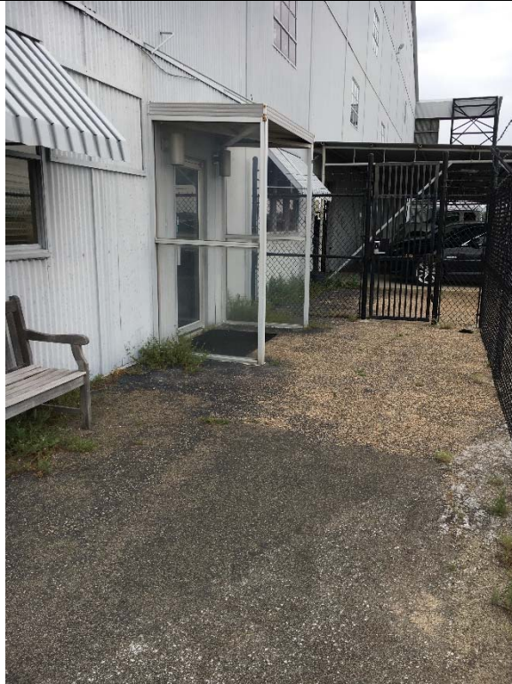
Violation 3 - The ground surface around the building is broken, uneven and unstable.