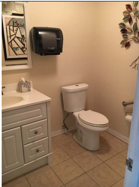
Violation 13 - The single user restroom is not large enough to accommodate a wheelchair turning space and could not be considered accessible restrooms.