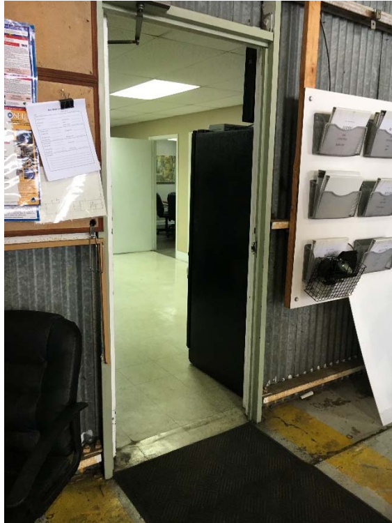
Violation 7 - The entrance into the office from the hangar area has uneven pavement that appears to have dropped.