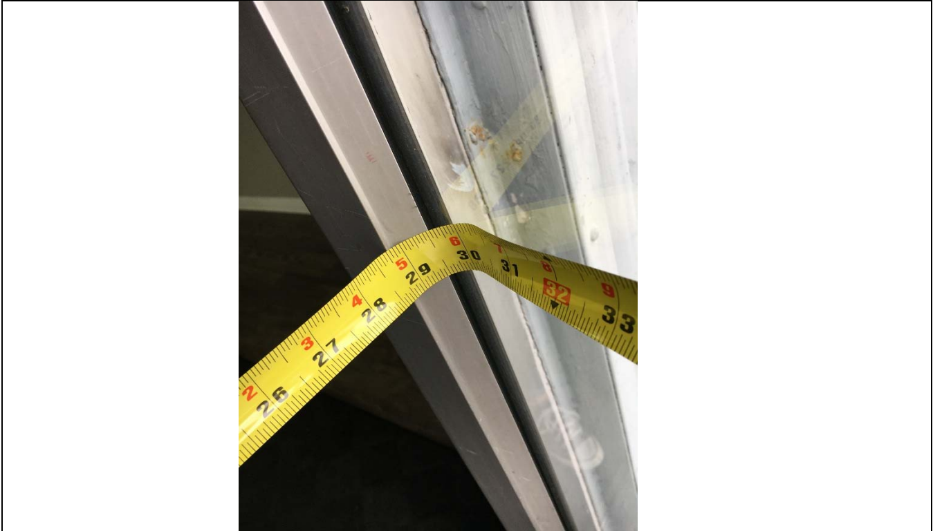
Violation 5 - The entrance door is only 28-1/2" wide where a minimum of 32" is required.