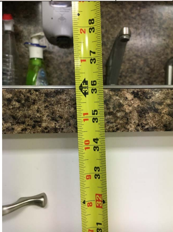
Violation 14 - The sink in the break room is at 36" where a maximum of 34" is required.