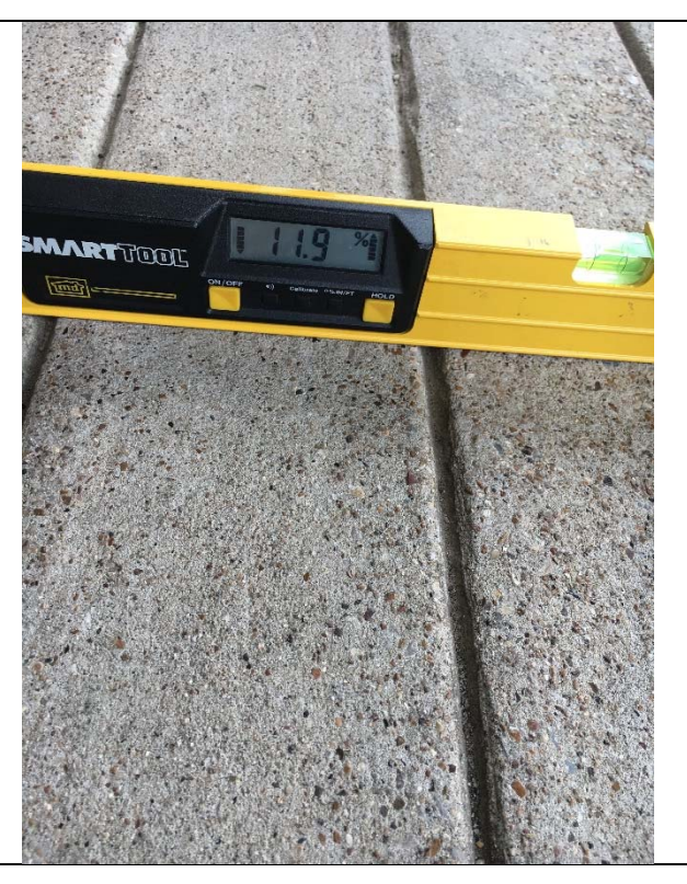
Violation 1 -The entrance into Hanger #2 has a 11.9% slope at the door.