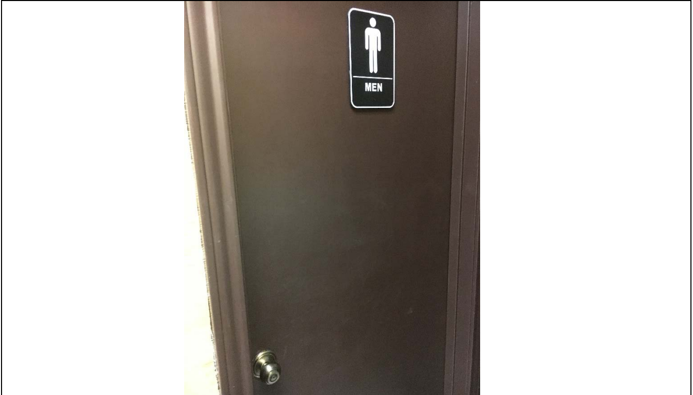
Violation 5 - Signage for the restrooms in the office area is mounted on the door.