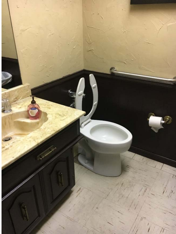
Violation 11 - Office area Men's Room: No rear grab bar is provided and the side grab bar is only 24" long.