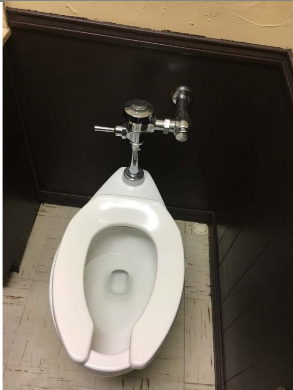
Violation 10 - Office are Men's room: The water closet does not have the required clear floor space.