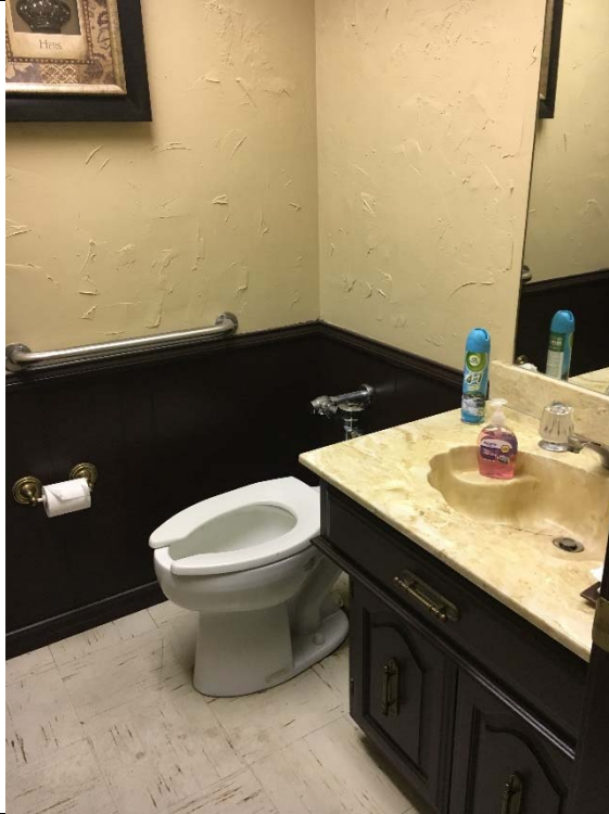
Violation 7 - Office area Women's Room: No rear grab bar is provided and the side grab bar is only 24" long.