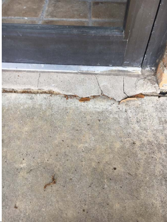
Violation 2 - The pavement at the main entrance door is broken.