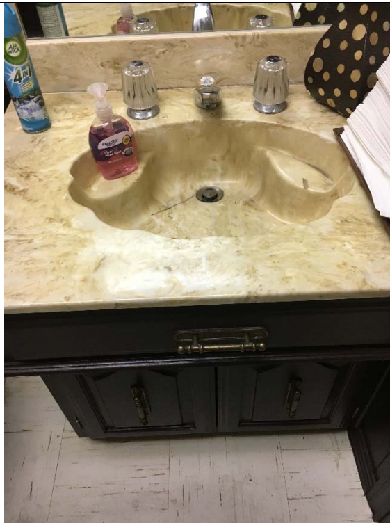
Violation 8 - Office area Men's and Women's Rooms: The lavatories do not have the required knee clearance.