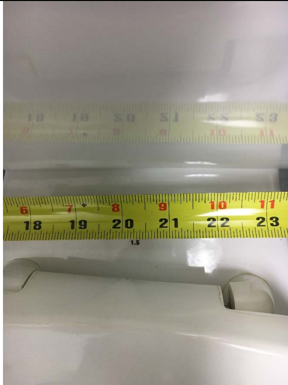
Violation 8 - The centerline of the water closet is at 21-1/2".