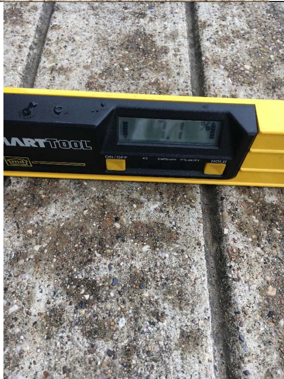
Violation 3 - The landing at the entrance has a 7.1% running slope.