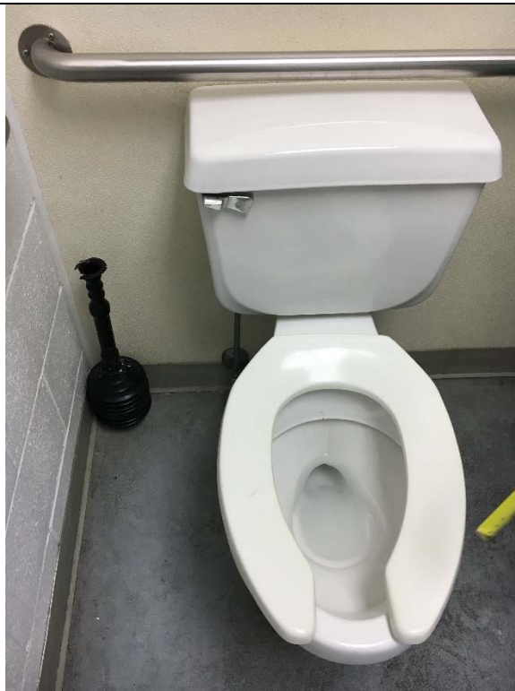
Violation 7 - The flush control is mounted on the closed side.