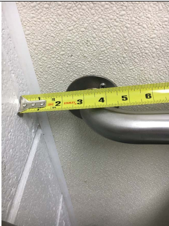
Violation 9 - The rear grab bar is not mounted in the proper location.