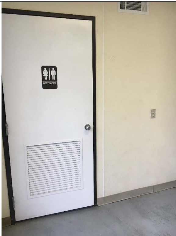
Violation 5 - Restroom signage is mounted on the door.