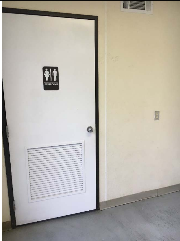
Violation 4 - Restroom door hardware requires grasping and twisting of the wrist to operate.