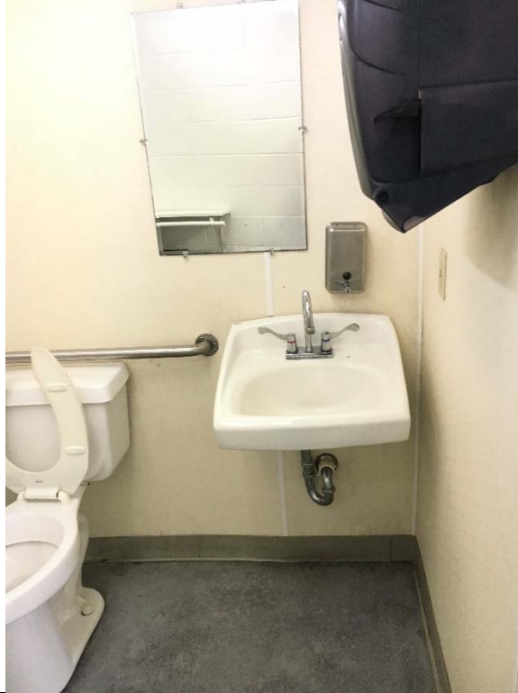
Violation 6 - The lavatory encroaches on the required clear floor space for the water closet.