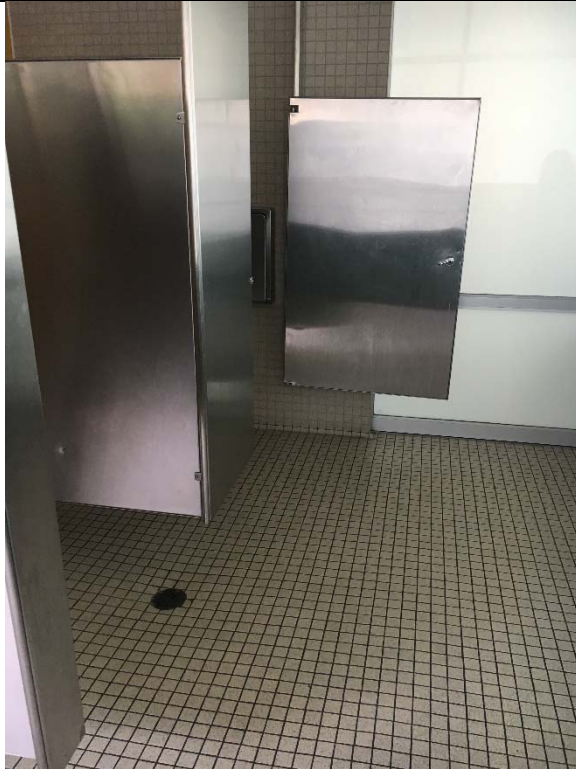
Violation 3: The accessible toilet compartment door in the Men's restroom is not self-closing.