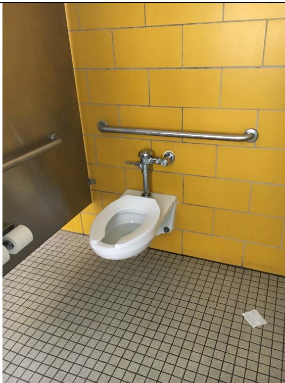
Violation 4: The flush control in the accessible toilet compartment in the Men's restroom is on the closed side.