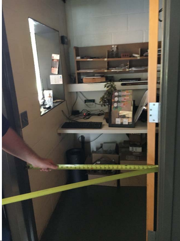
Violation 8 - The work room behind the reception area only has a 28.5" door opening with a 5.5" maneuvering clearance provided on the pull side of the door.