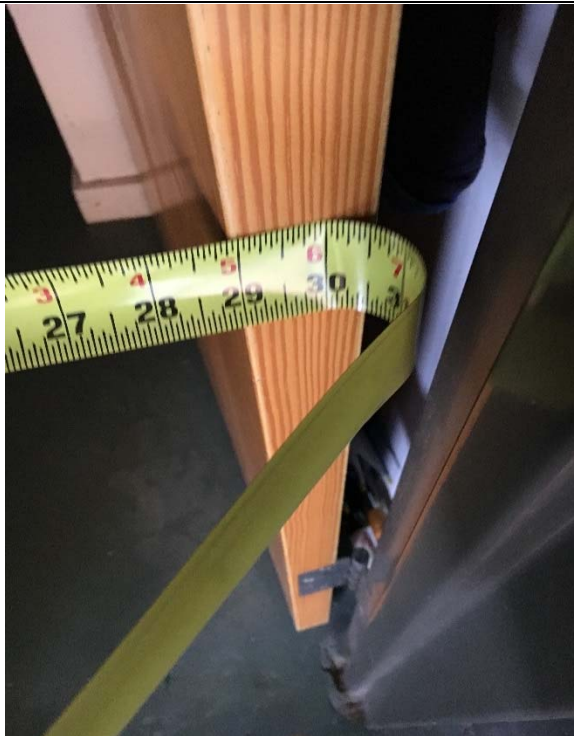
Violation 9 - The storage room behind the reception area only has a 29" door opening with a 10 1/4" maneuvering clearance on the pull side.