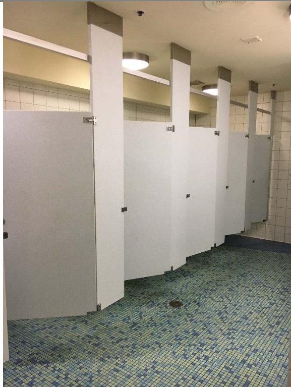
Violation 7 - The Women's restroom has seven (7) toilet compartments and no ambulatory stall.