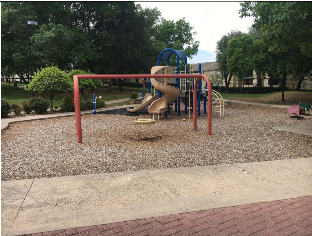
Violation 12 - The playground surface consists of wood chips and is not stable.