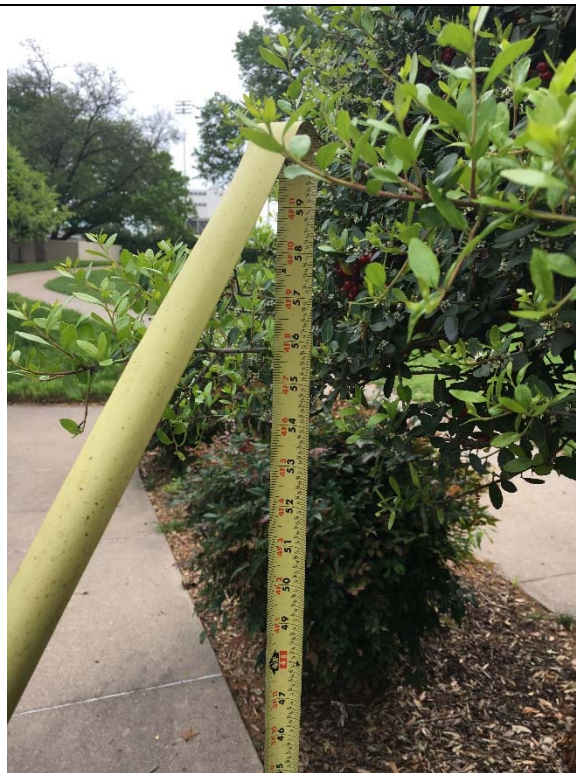
Violation 5 - There is a tree along the path around the park that hangs down at 59" aff.