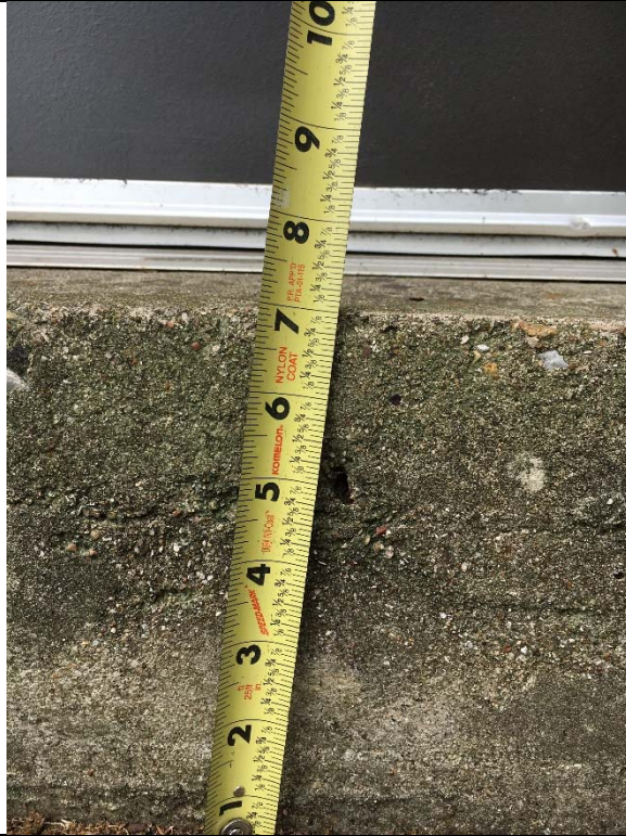
Violation 11 - There is a building on the park site that requires a 7" step to enter.