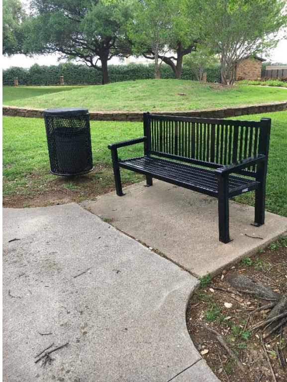
Violation 9 - The benches along the path do not provide an area next to them for companion seating.