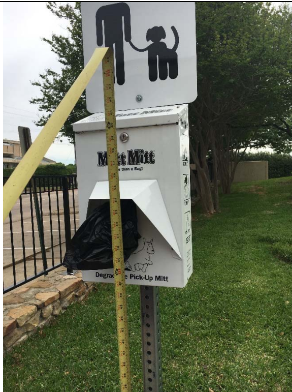
Violation 8 - The portion of the pet waste disposal containers where the bags are located at 51" above finished floor.