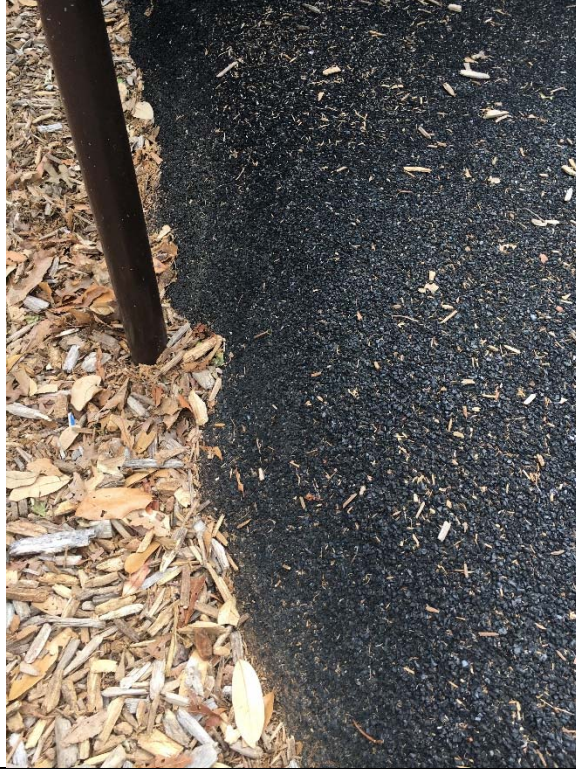
Violation 7 - There is not a level transfer space next to the play structure. The area has a drop off.