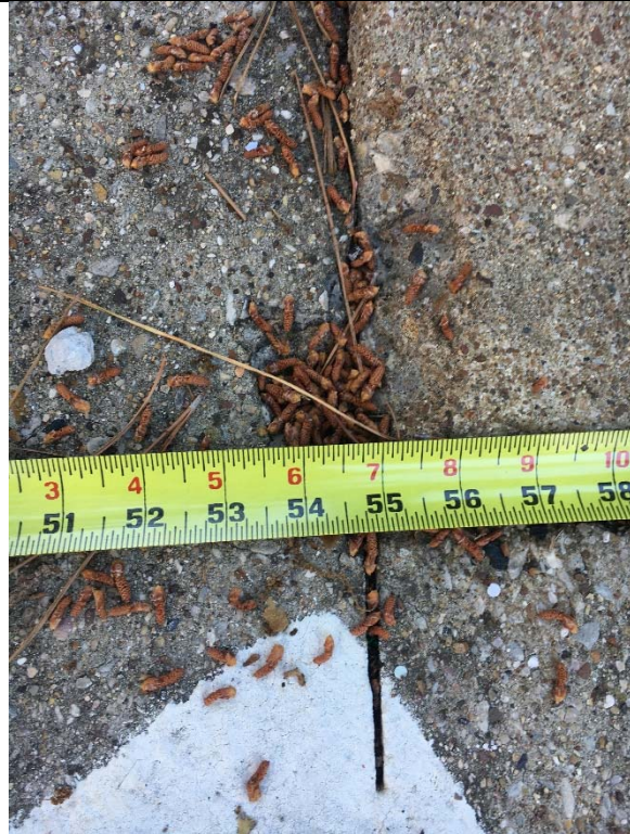
Violation 3 - The access aisle narrows down to 55" wide where the ramp is located.