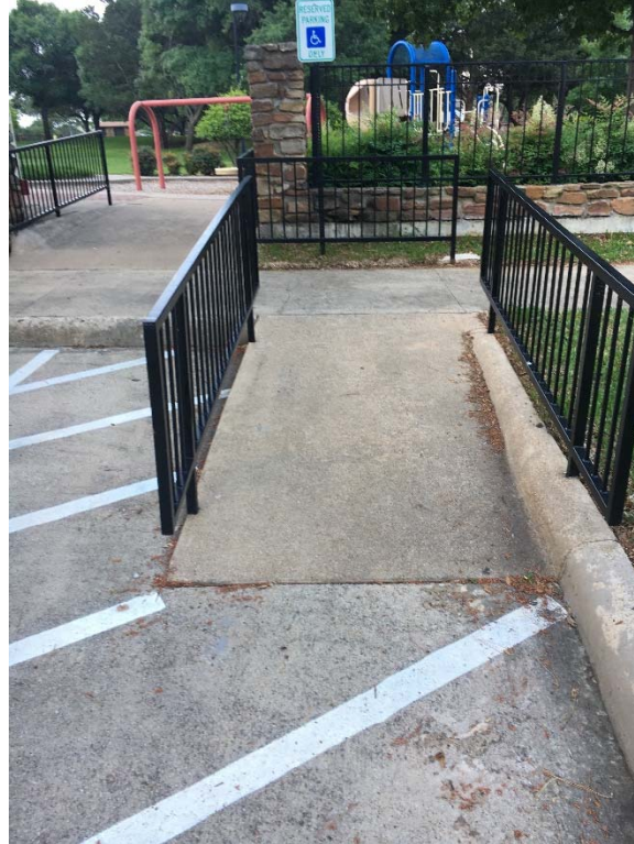
Violation 4 - The ramp serving the accessible parking protrudes into the access aisle.