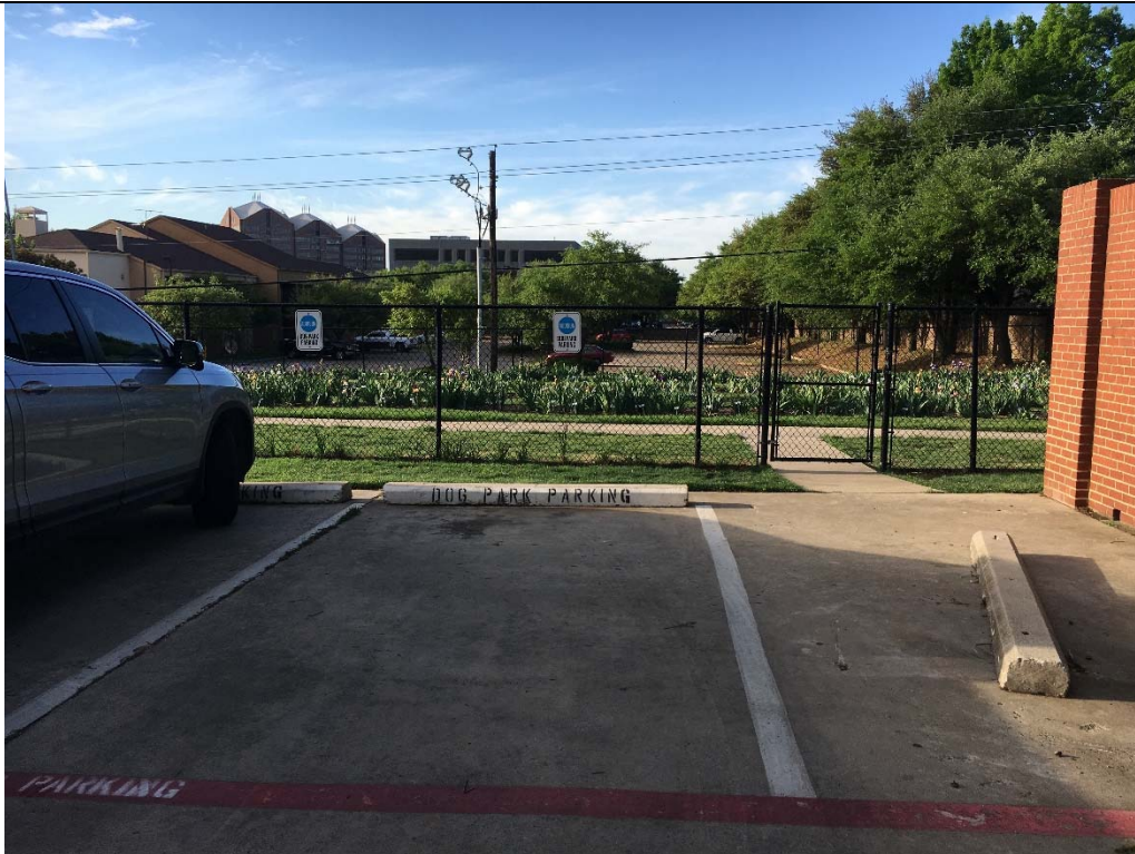
Violation 1 - There are no accessible parking spaces provided.