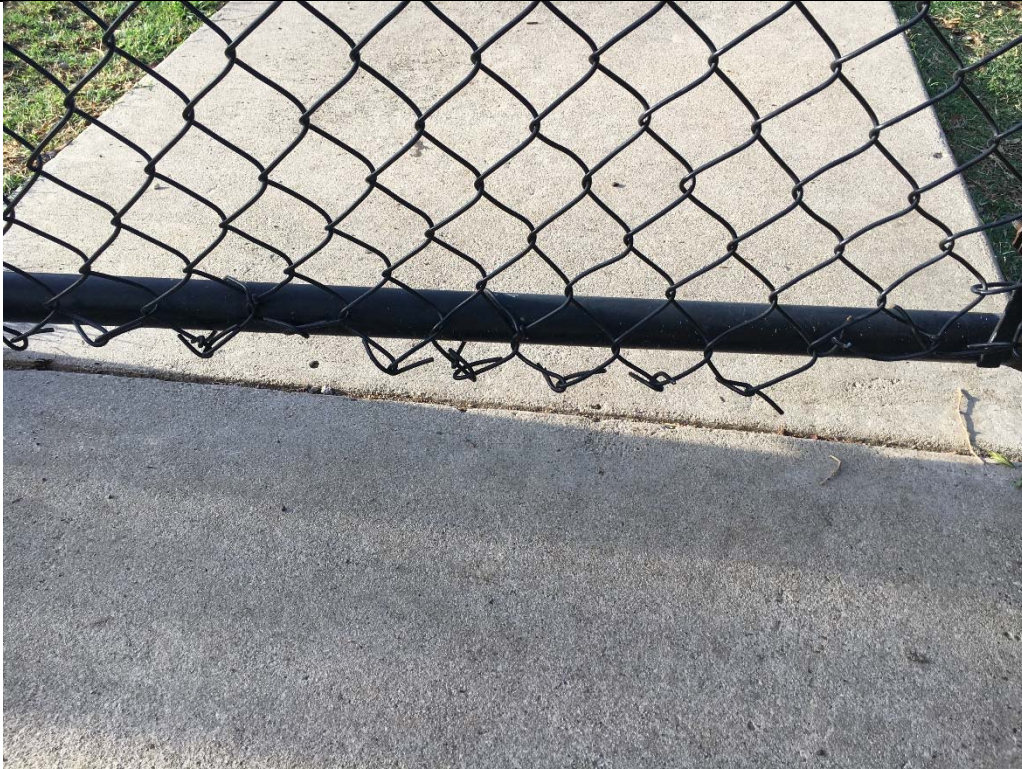
Violation 2 - The bottom of the main entrance gate door is not smooth.