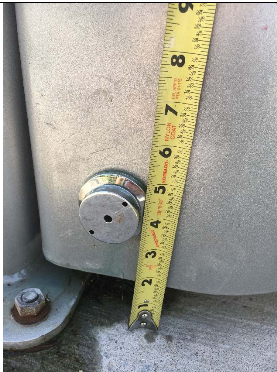
Violation 9 - There is a drinking fountain provided with a dog watering portion. The button to operate this portion is too low at 4" above finished floor.