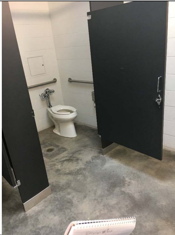
Violation 4 - Women's accessible stall door is not self-closing.