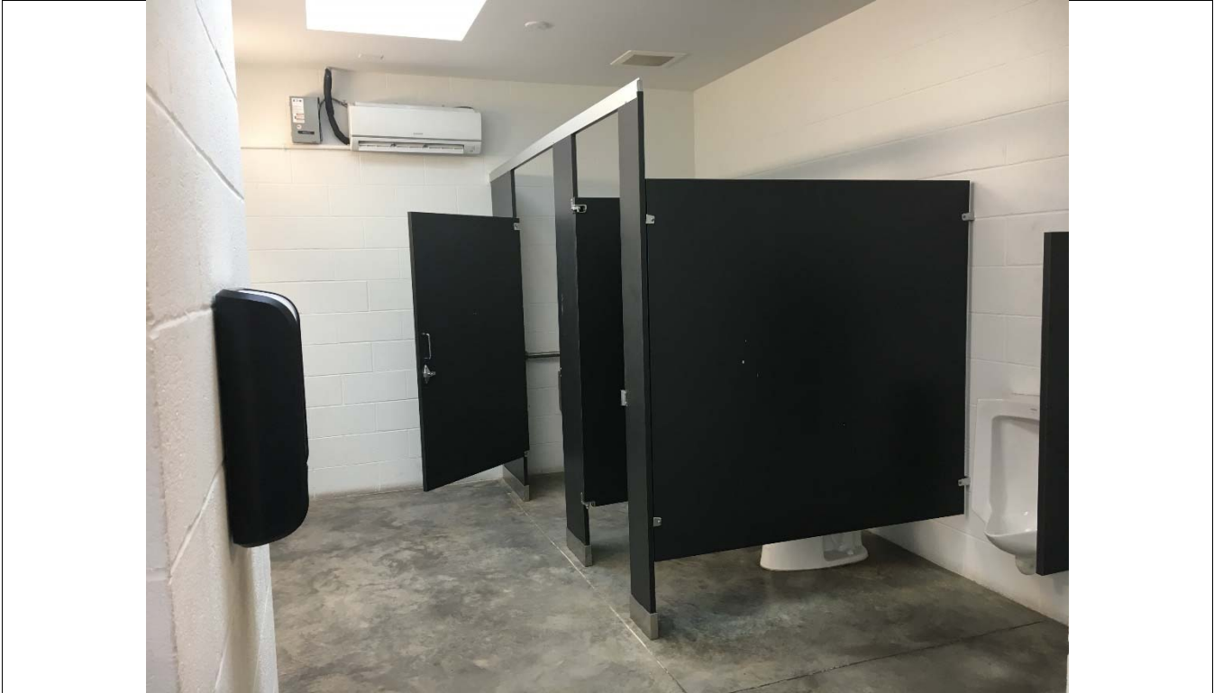
Violation 5 - Men's accessible stall door is not self-closing.