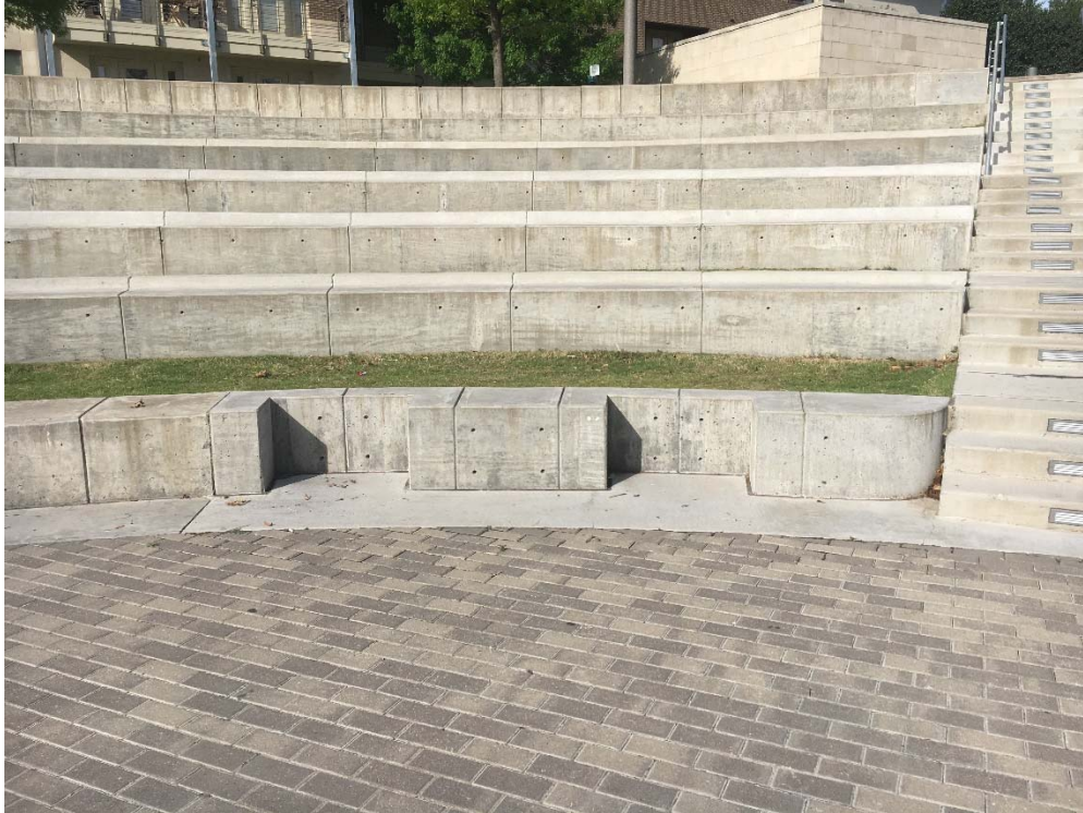
Violation 8 - The accessible seating at the Amphitheater is only 30" wide by 14" deep where a 36" wide and 48" deep companion seating is required to be provided.