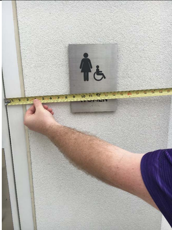
Violation 3 - All restroom signage should be centered at 9" from the door jamb.