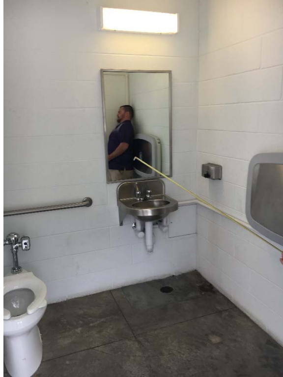
Violation 6 - The clear floor space for the water closet in the Family restroom is only 51" wide where a minimum of 60" wide is required.