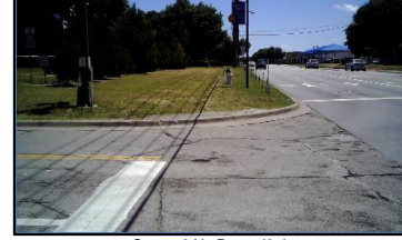
Corner 3 No Ramp (3z)