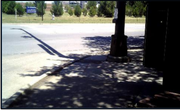
Corner 4 No Ramp (4z)