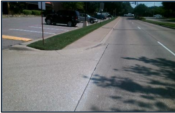
Corner 1 No Ramp (1z)