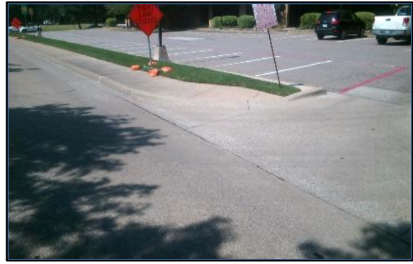
Corner 4 No Ramp (4z)