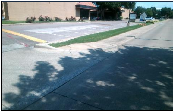
Corner 1 No Ramp (1z)