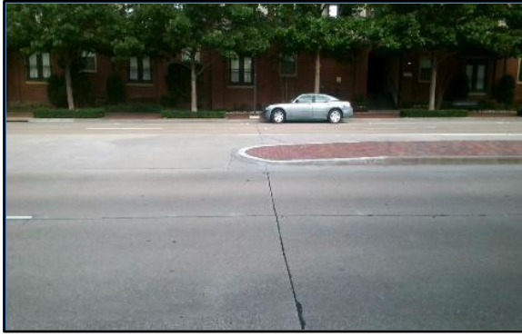
Corner 1 No Ramp (1z)