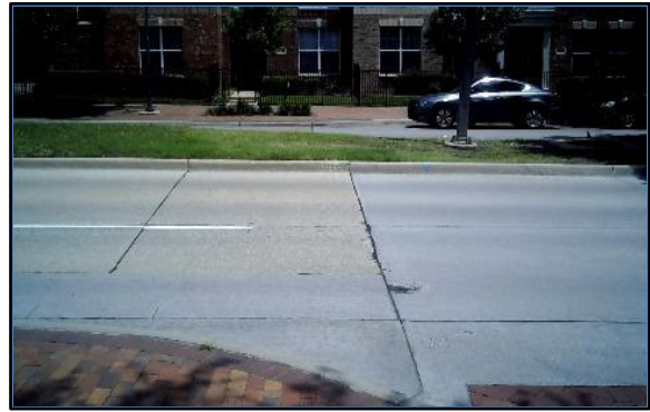
Corner 2 No Ramp (2z)