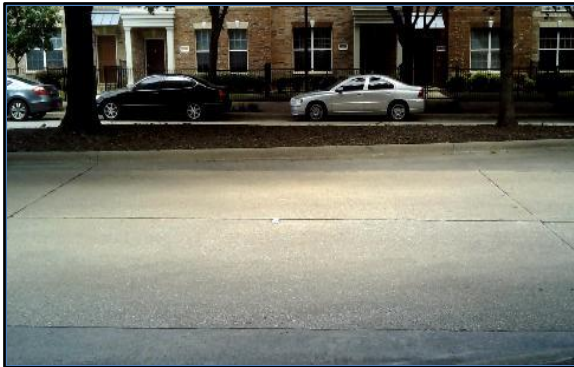
Corner 3 No Ramp (3z)