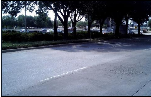
Corner 3 No Ramp (3z)