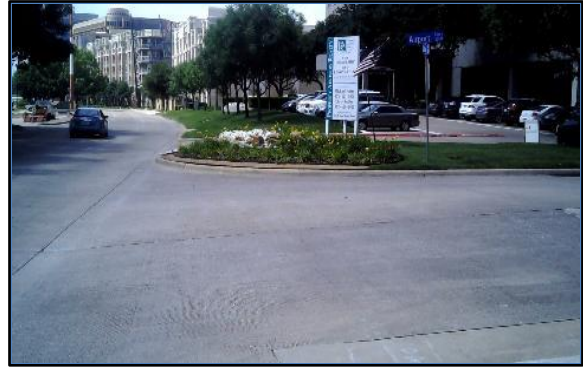
Corner 4 No Ramp (4z)