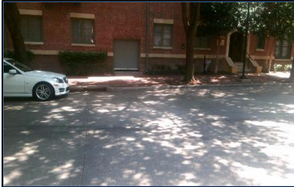
Corner 3 No Ramp (3z)