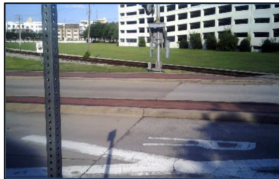
Corner 3 No Ramp (3z)