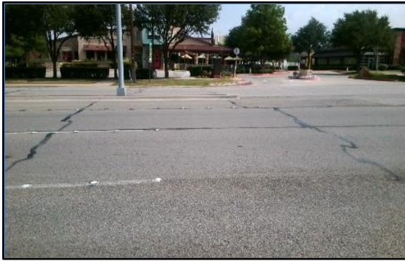
West Median No Ramp (Wz)