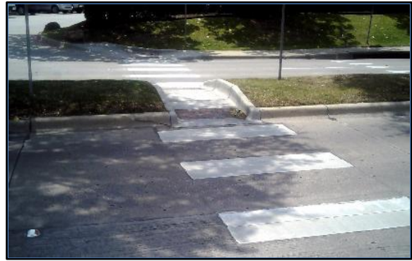
Ramp North G