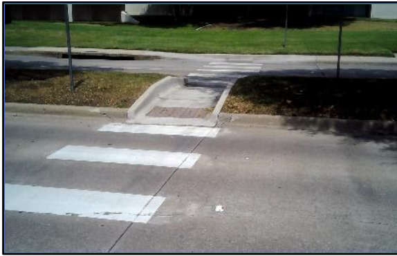
Ramp North F