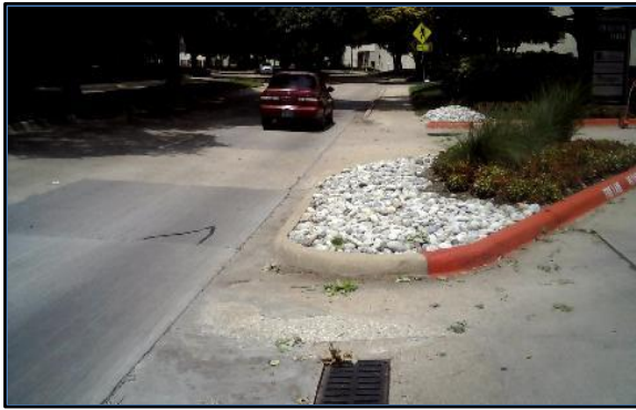
East Median No Ramp (Ez)