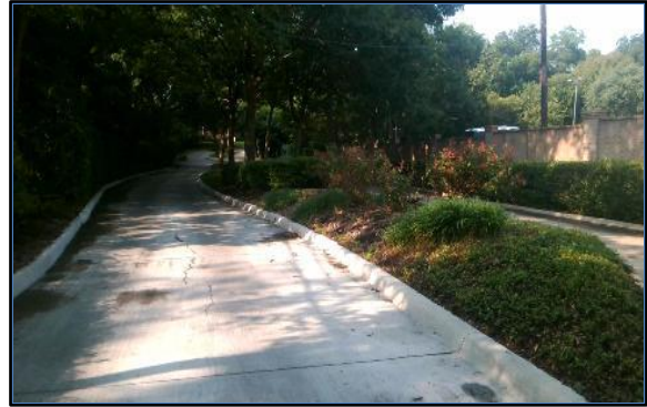
Corner 4 No Ramp (4z)