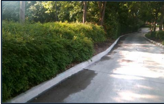
Corner 3 No Ramp (3z)