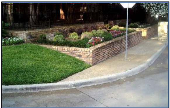
Corner 4 No Ramp (4z)