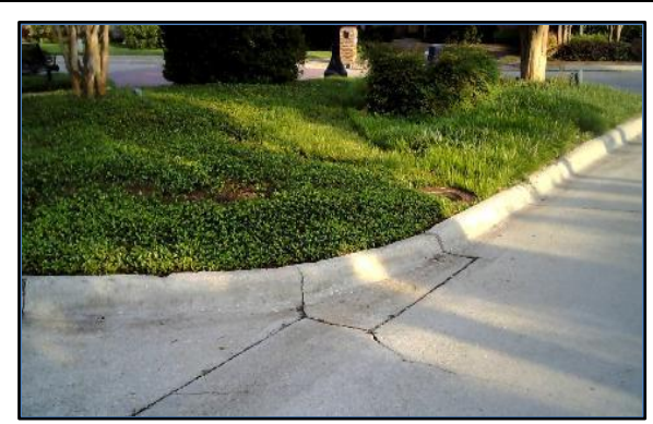
Corner 1 No Ramp (1z)