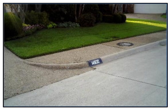
Corner 3 No Ramp (3z)