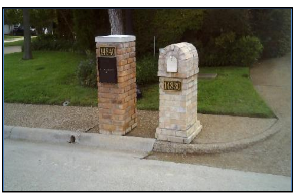
Corner 2 No Ramp (2z)