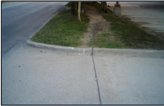
Corner 2 No Ramp (2z)