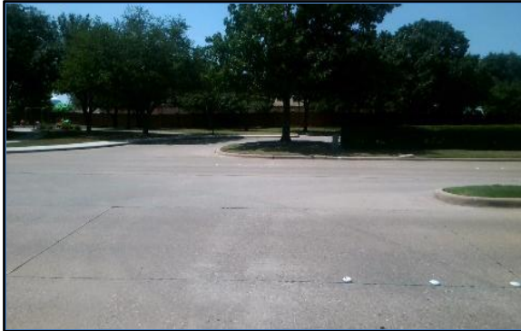
Corner 2 No Ramp (2z)