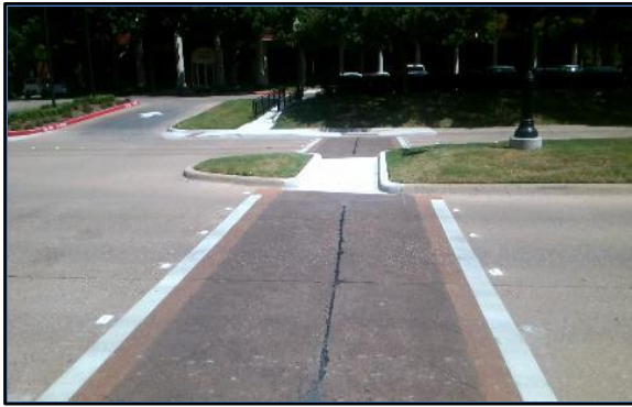
Ramp West F