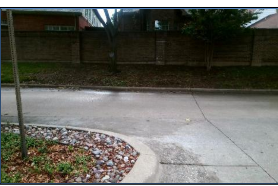
Corner 2 No Ramp (2z)