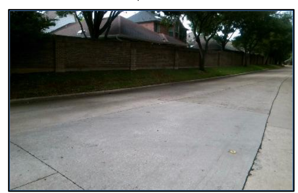
Corner 3 No Ramp (3z)