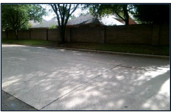
Corner 2 No Ramp (2z)