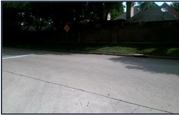
Corner 1 No Ramp (1z)