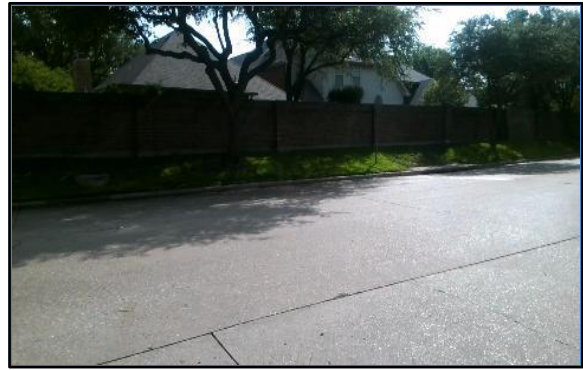
Corner 2 No Ramp (2z)