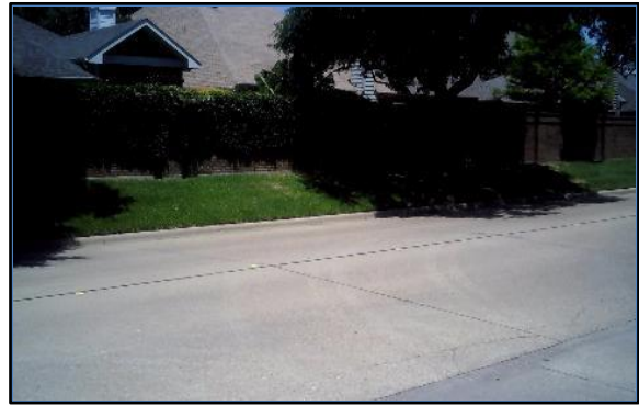
Corner 2 No Ramp (2z)