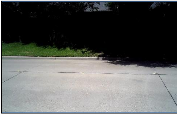
Corner 1 No Ramp (1z)