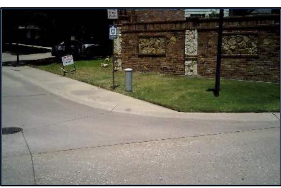
Corner 2 No Ramp (2z)