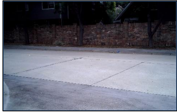
Corner 3 No Ramp (3z)