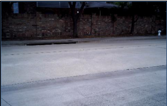
Corner 4 No Ramp (4z)