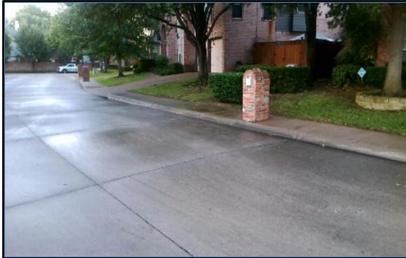
Corner 3 No Ramp (3z)