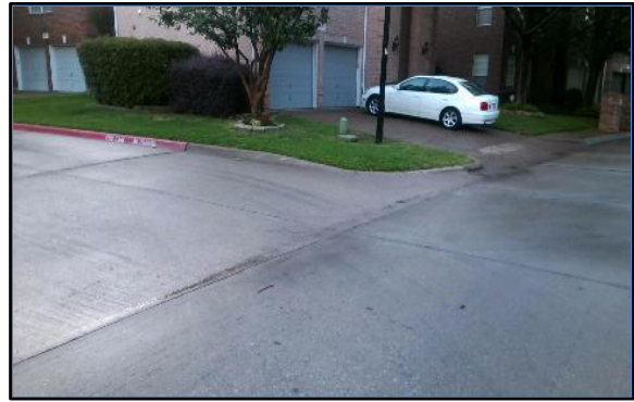
Corner 2 No Ramp (2z)