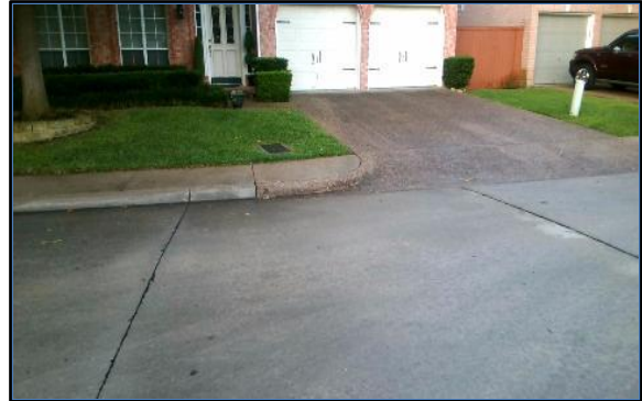
Corner 4 No Ramp (4z)