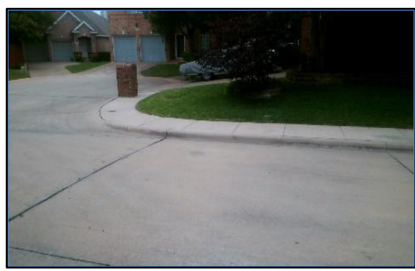
Corner 1 No Ramp (1z)