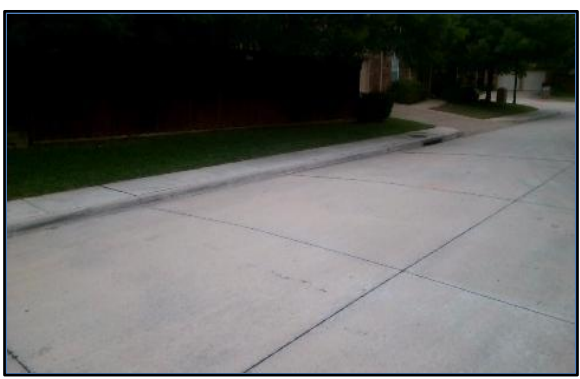
Corner 2 No Ramp (2z)