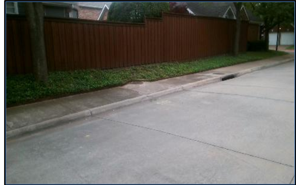
Corner 4 No Ramp (4z)