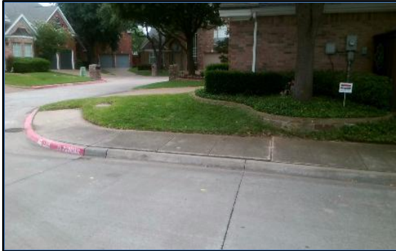
Corner 3 No Ramp (3z)