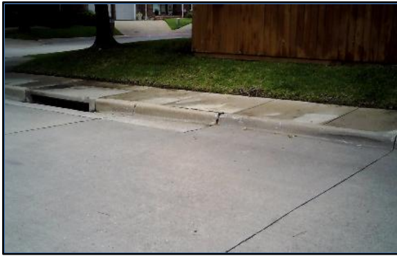
Corner 1 No Ramp (1z)