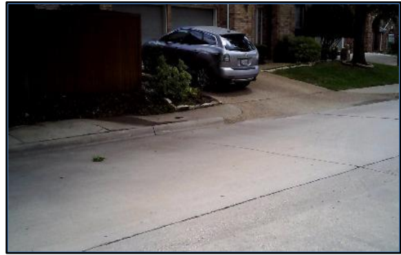
Corner 2 No Ramp (2z)