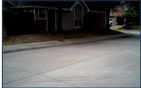
Corner 4 No Ramp (4z)