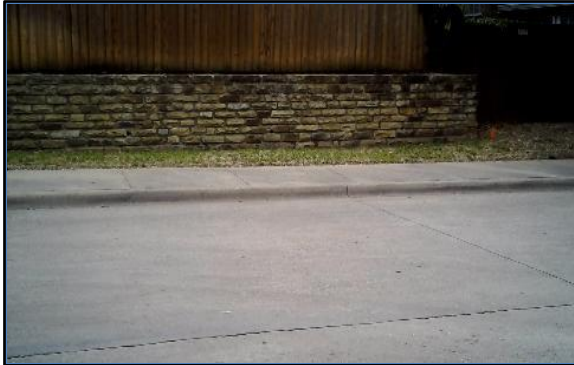
Corner 3 No Ramp (3z)