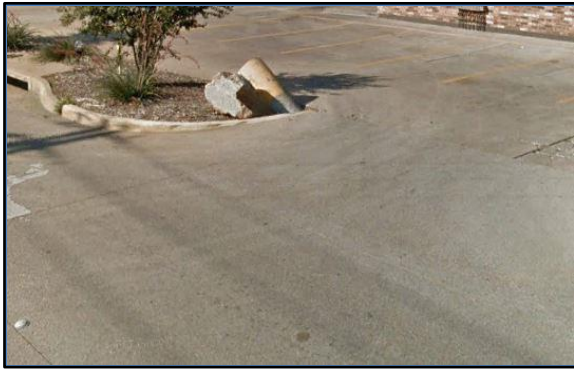
Corner 1 No Ramp (1z)