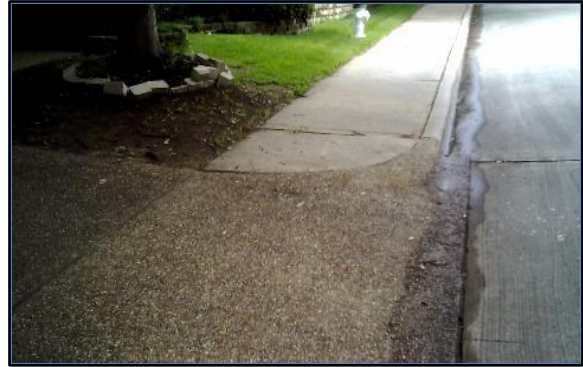
Corner 4 No Ramp (4z)