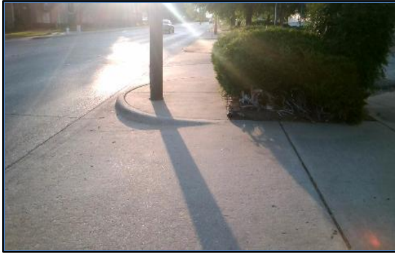
Corner 3 No Ramp (3z)