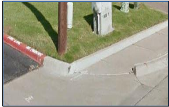
Corner 2 No Ramp (2z)