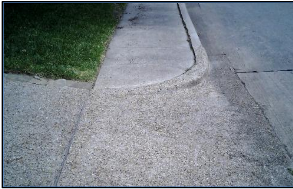
Corner 1 No Ramp (1z)