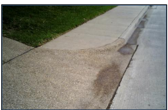
Corner 2 No Ramp (2z)