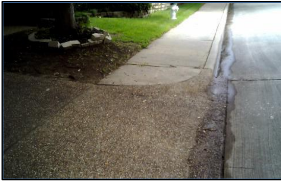
Corner 1 No Ramp (1z)