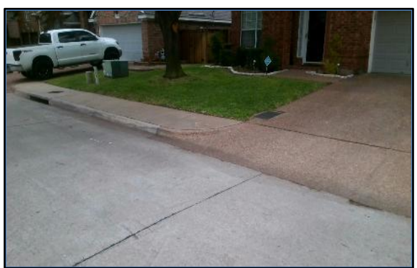
Corner 4 No Ramp (4z)