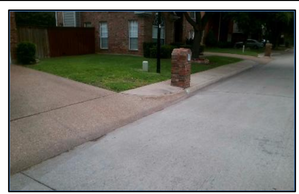
Corner 1 No Ramp (1z)