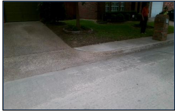
Corner 4 No Ramp (4z)