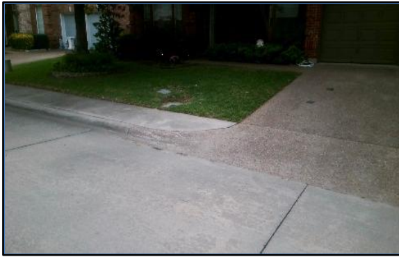
Corner 3 No Ramp (3z)