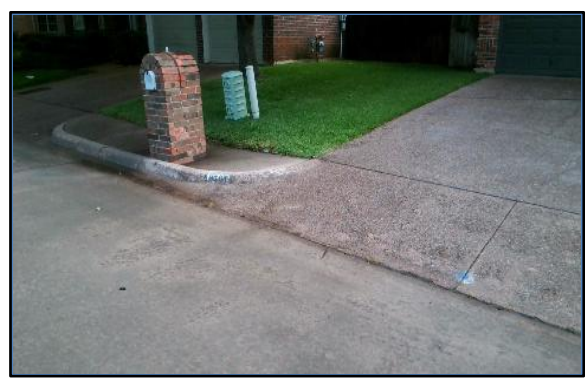
Corner 1 No Ramp (1z)